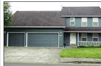
1463 Ballard Dr E, Monmouth