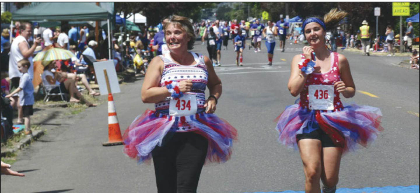
The Fourth of July Mini-Marathon finishes in downtown Independence.