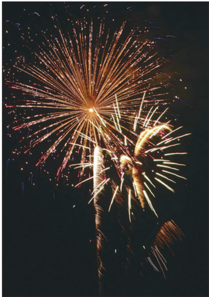
Independence will offer two fireworks displays.

Dallas' fireworks show doesn't boast the history of the Western Days display, but it's no less impressive. The show begins around 10 p.m. on July 4 and is put on by Dallas Fire & EMS and gives locals a chance to take in an impressive display without having to travel.