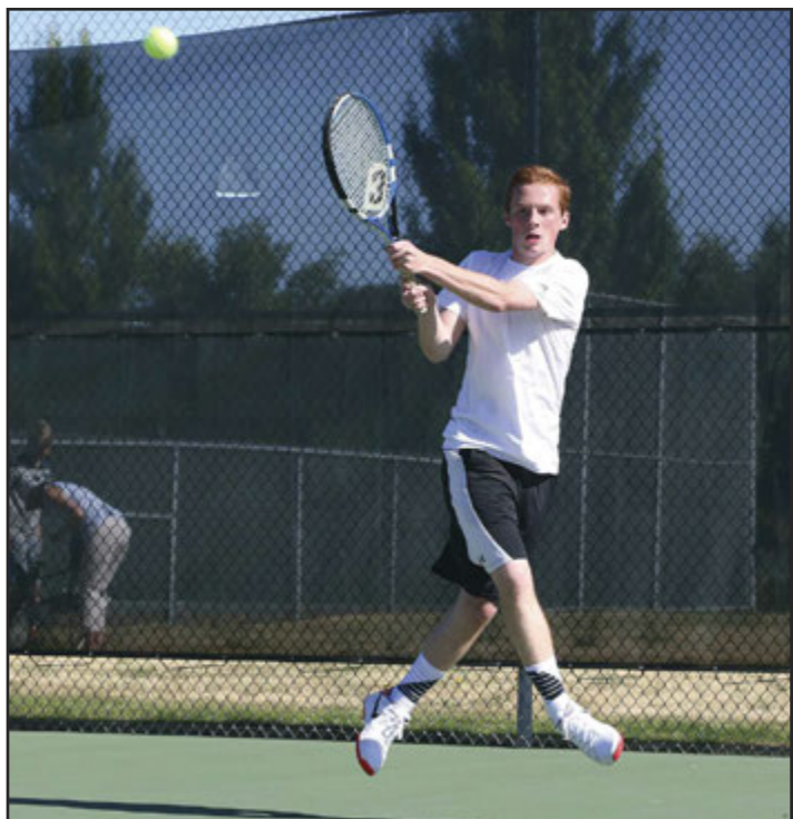
Players of all skill levels are welcome to participate.

Where: Matches will take place at Western Oregon University and Central High School.