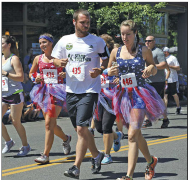
The mini-marathon offers a unique, fun experience.

Water will be available at various points along the course and snacks and hydration await you at the finish. A