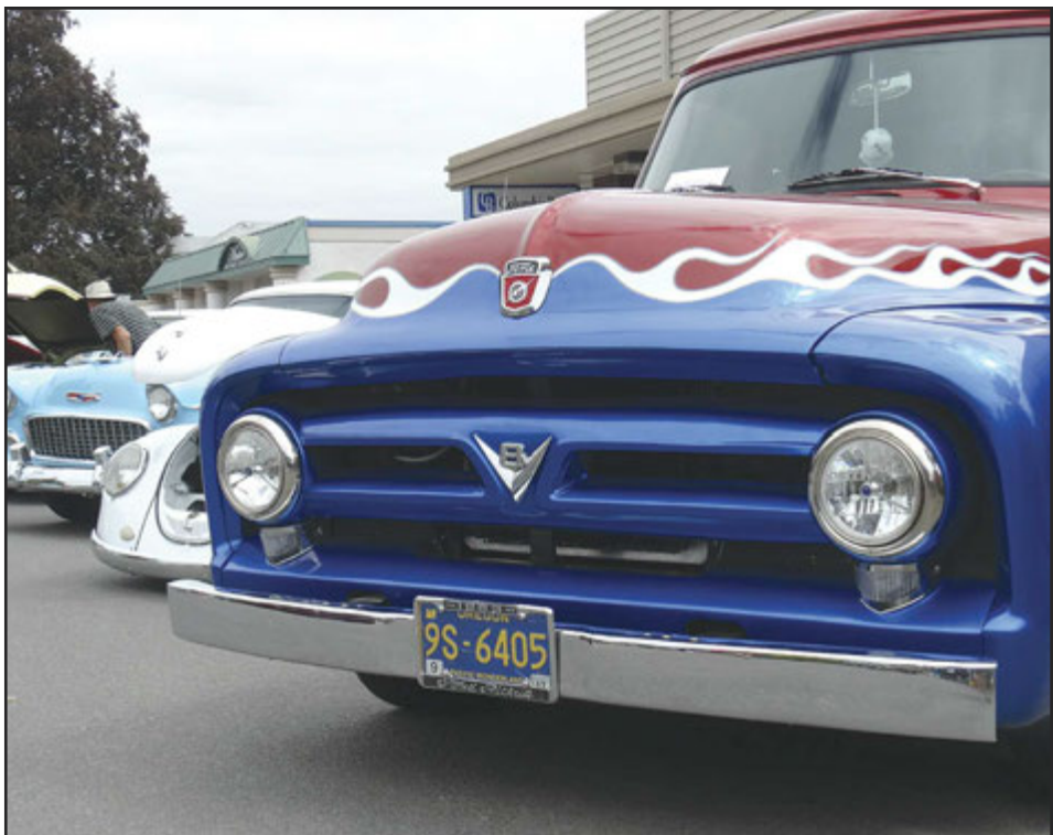
From classic cars to fireworks there are plenty of ways to celebrate Independence Day in Dallas, Falls City, Independence and Monmouth.

This year, entrance to the show will be $2, unless wristbands are purchased ahead of time at Les Schwab or from someone in the Monmouth-Independence Rotary Grand Parade on July Fourth.