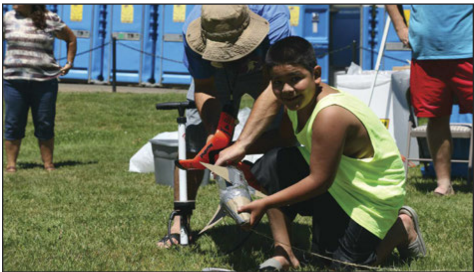
Western Days has a variety of entertainment and activities going on.

This year, entrance to the show will be $2, unless wristbands are purchased ahead of time at Les Schwab or from someone in the Monmouth-Independence Rotary Grand Parade on July Fourth.