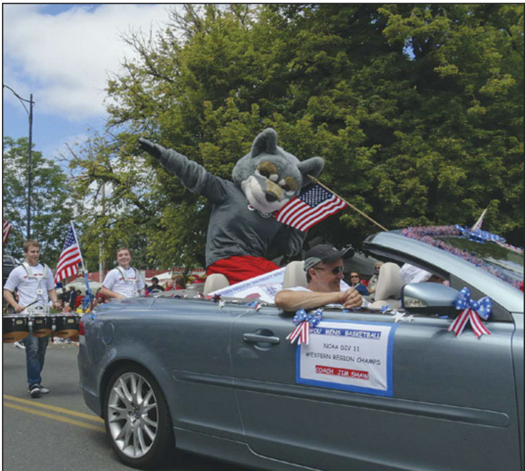
The Grand Parade showcases the county's patriotism and local pride.