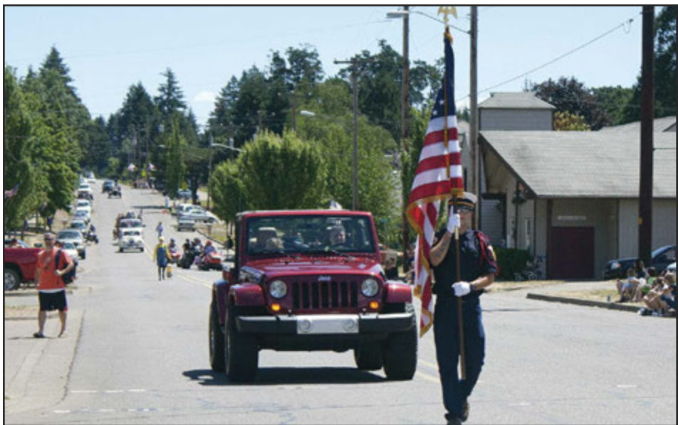
Falls City celebrates Independence Day with small-town fun and charm.

All food is donated by Falls City restaurant The Boondocks.