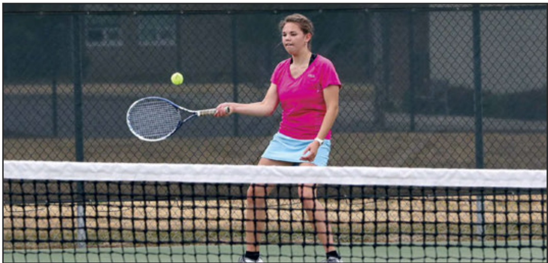
The Fourth of July tennis tournament offers singles and doubles brackets.

All participants must bring a can of balls. Cost is $15 for singles and $25 for doubles. All proceeds from the tourna-