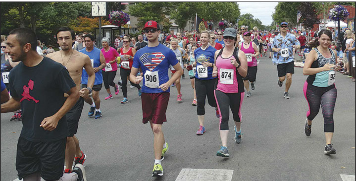
The mini-marathon takes runners down the parade route in front of thousands of cheering fans.

"The cheering crowds along the way make this a truly unique and memorable run," Cable said.