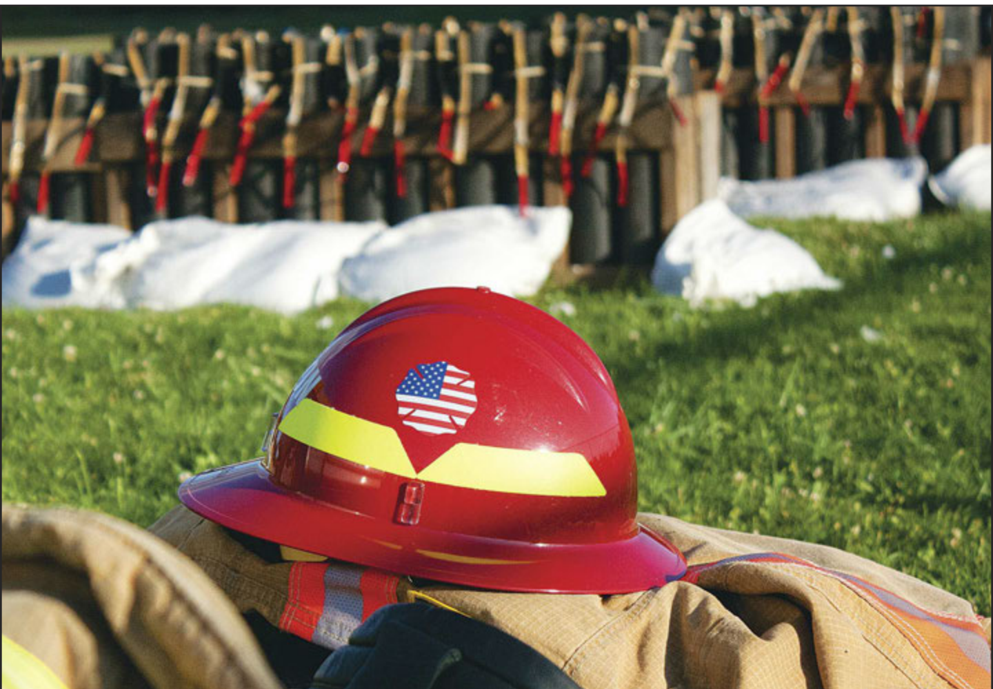
Dallas' Freedomfest offers food, entertainment and fireworks for all to enjoy.

Remember to bring lawn chairs and blankets and stay until dark for the patriotic evening capper fireworks show, put on by Dallas Fire & EMS. It blasts off at dark, or around 10 p.m.