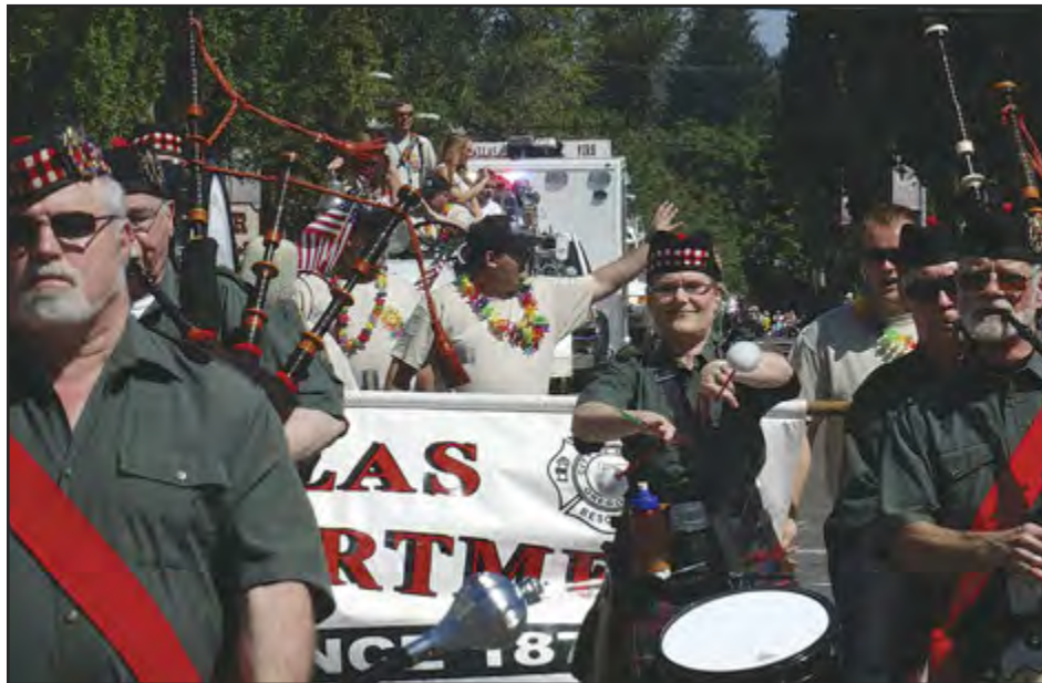
The Summerfest Parade is always one of the main attractions of the weekend.

Be prepared to encounter aliens and astronauts and probably more than one version of "Total Eclipse of the Heart," as the parade makes its way through downtown, starting at the corner of Jefferson