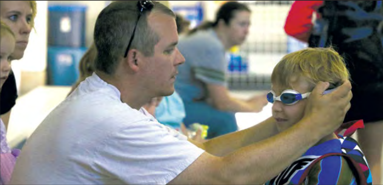
The Kids' Triathlon gives participants a chance to swim, bike and run and earn a medal for their efforts.