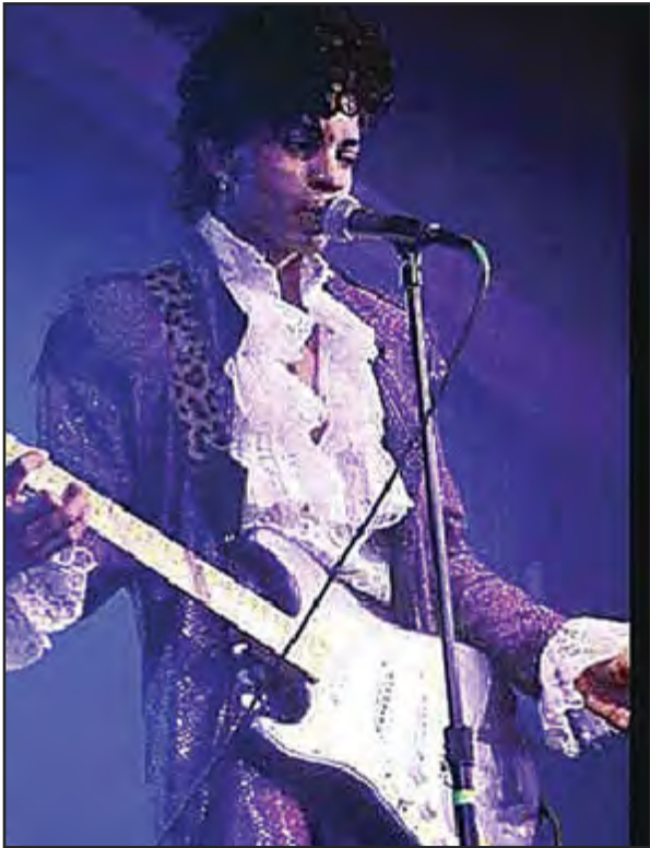
Erotic City, a Prince tribute band, will perform Saturday from 7 to 9 p.m.