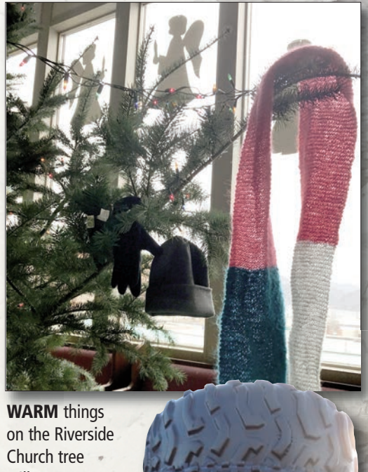
Church tree will go to the homeless.