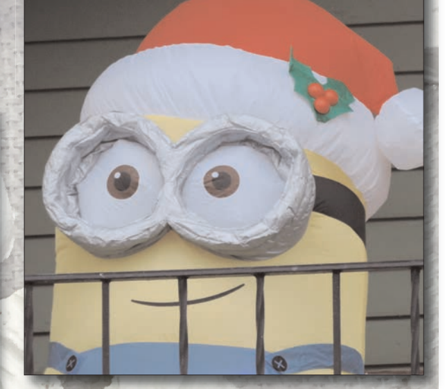
MINION on State Street and wreath at Parkhurst Place are examples of decorations pop culture and traditional; the wreath, from the facility's Dec. 9 wreath contest, has a modern touch: it is adorned with lavender products.