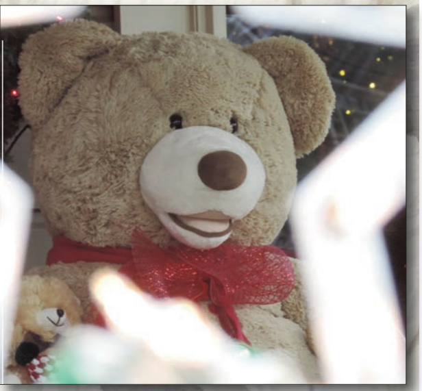
OAK Street Hotel lights frame a teddy bear on the porch.