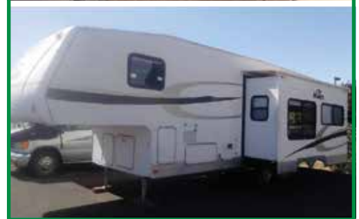
30 Ft 2009 Thor Wave 295Rls $14,500

269 NE Polk Station Road, Dallas, OR 97338 Visit us online at xtramilervsales.com