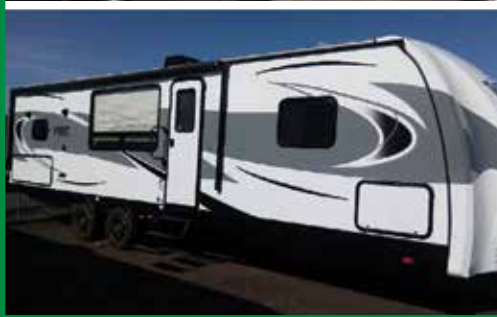
31 Ft 2018 Forest River Vibe 268Rks $25,500

Whether you are looking for repair & maintenance or to purchase a new to you RV, we promise Stellar service every time!