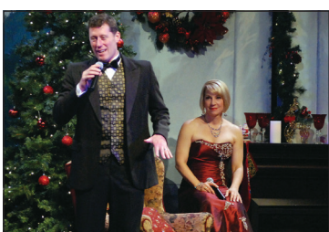
The Shedd in Eugene will showcase many Christmas favorites during its two December shows.

The Shedd's annual holiday concert, "Ring Those Bells: A Jazz Kings Christmas 2018," returns Dec. 6 and 9 in Eugene, and Dec. 10-12 in Roseburg, Corvallis